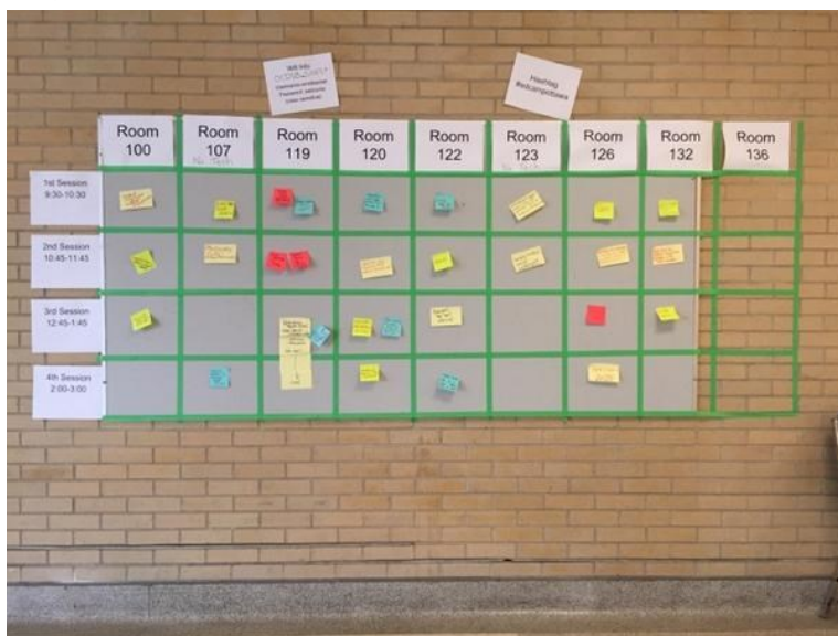
Participants create their own schedule based on their own interests, questions, and specialties.

It doesn't cost anything to attend EdCamps. Educational stakeholders (including teachers, administrators, parents, board members, and anyone else interested) learn and share with others with like interests. By building your own professional learning network, you can