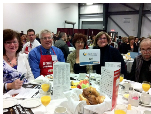
OSSTF D25 supports United Way Ottawa.

Many OSSTF members contribute to the annual United Way Ottawa fundraiser drive through direct payroll deductions—sometimes donating directly to the Education Foundation of Ottawa. Over the past five years, staff and students with the OCDSB have raised over $1.4 million. For more information, visit: http://www.ocdsb.ca/com/pship/Pages/UNITED-WAY.aspx