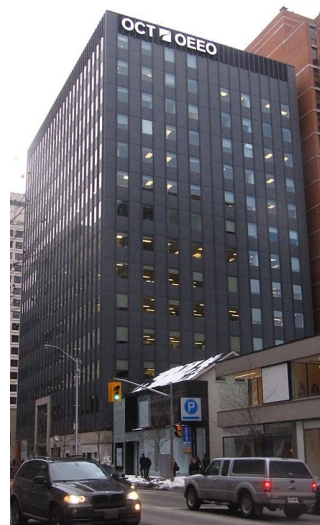
No, it's not the Ministry of Love; this is the OCT's headquarters in Toronto.

These ten examples of the OCT doing more than its mandate account for a large part of the membership fees that Ontario teachers are paying into this organization. This is an organization in which 14 of the councillors are appointed by the provincial government and 23 of which are elected by teachers representing different boards, languages, and regions. In many of these cases I don't see how the OCT is doing its duty to serve and protect the public interest.