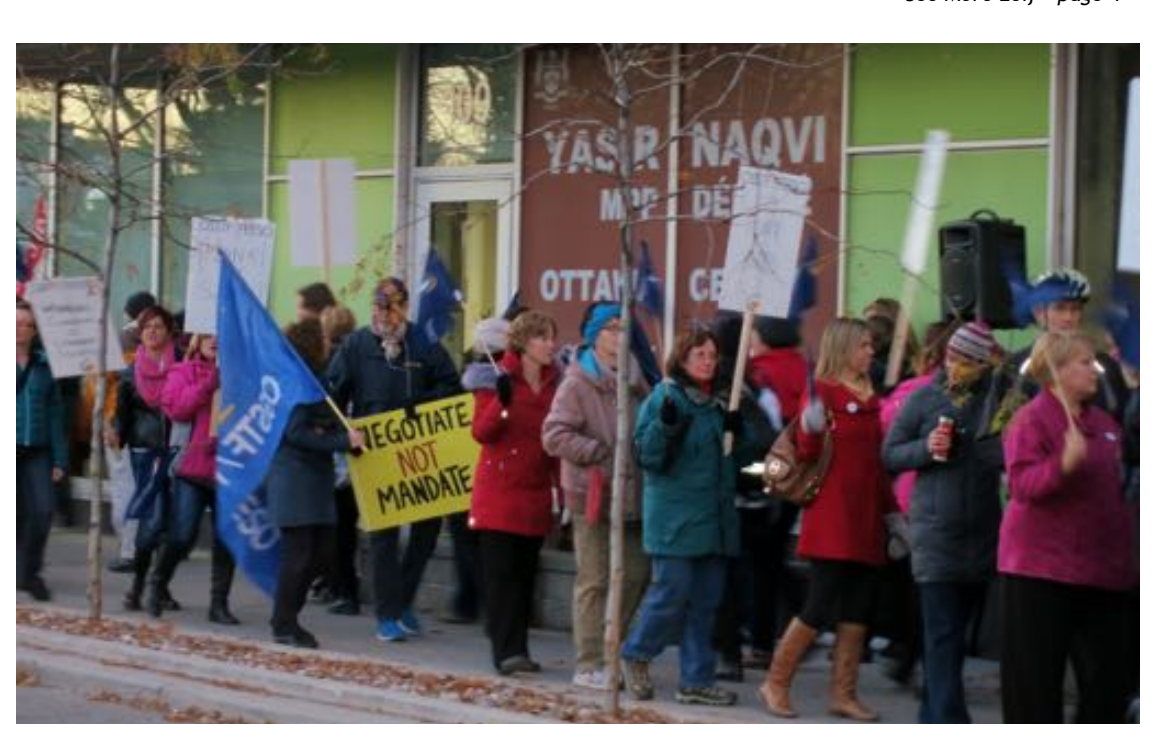
Support Staff Rally in front of MPP Yasir Naqvi's office - November 2015